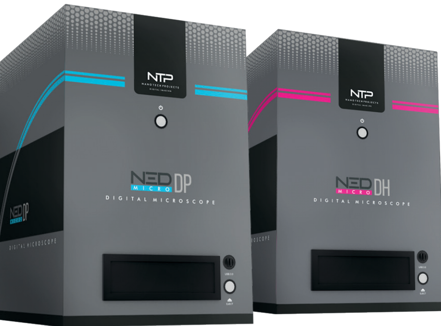
NED-DP for Digital Pathology