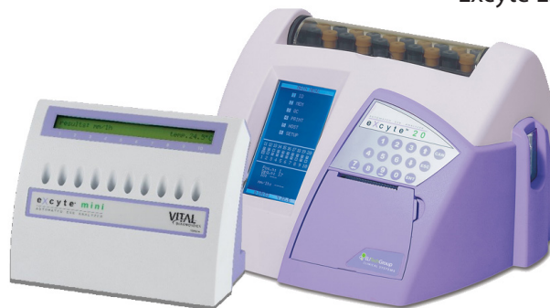
Excyte® Mini Minimum 50 tests/month

With the "Get Excited!" Placement Program, acquiring an Excyte Automated ESR analyzer is simple and stress-free. The laboratory agrees to purchase Excyte ESR Tubes (vacuum or non-vacuum) and ELITechGroup will provide an Excyte analyzer for use in the laboratory. That's it! Now that is something to Get Excited about.